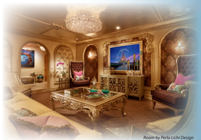
Room by Perla Lichi Design