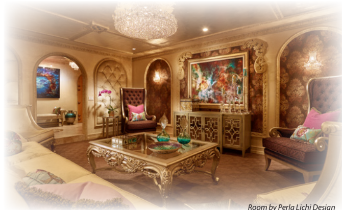
Room by Perla Lichi Design

Although dedicate theme theaters can be impressive, many people have other parameters for their rooms. Dual purpose rooms are far more popular. Some chose a combination of theater and game room and others are looking for a sort of chameleon room, such as a formal living room where the screen is hidden and the speakers are invisible to the decor of the room. Imagine at the touch of a button a screen appears, and the sound track seems to be coming from all around you without a speaker in sight. Any of these options requires great time and planning. Let's plan together!